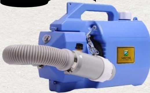
MODEL 1.3 GALLON-110